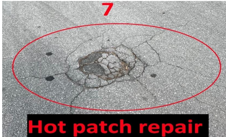
Hot patch repair