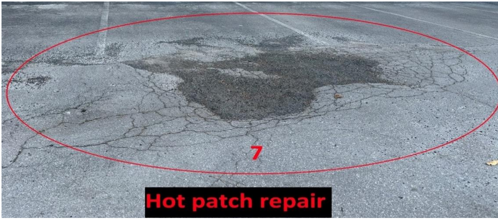
Hot patch repair