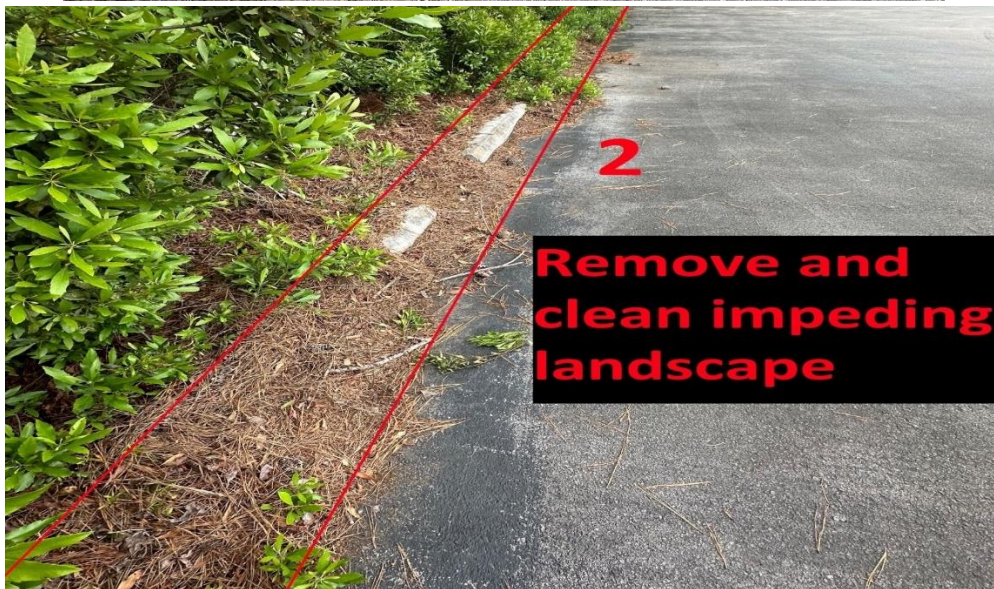
Remove and clean impeding landscape