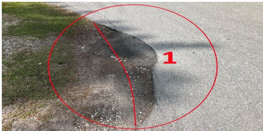
Hot patch repair example