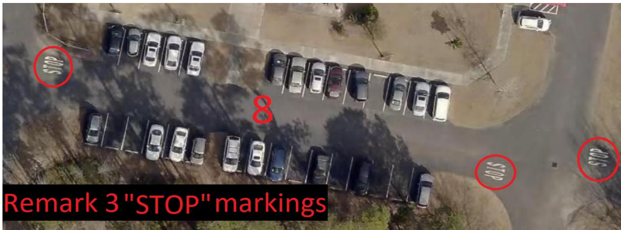
Remark 3 "STOP" markings

Mailing: 5231 Business Drive, Newport, NC 28570