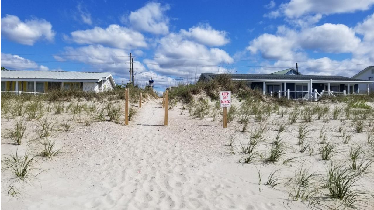
Figure 4 – Sea oats less than a year after initial planting near 5 th Street, Emerald Isle looking extremely robust and doing their job of “sand catching” very well.

And lastly, please help the plants by educating visitors to not step on the new plantings. The plants have enjoyed the luxury of a climate-controlled greenhouse and are now subjected to salt spray and the heat of the beach – they need to be left alone so they can grow like you see here (Fig. 4) – just about a year after initial planting. For property owners - please wait until AFTER EarthBalance has completed their work planting if you wish to install sand fencing and/or post-and-rope borders along the walkways. Also check with the Emerald Isle Planning & Inspections Department as well before disturbing the dune as the State has some new(er) guidelines that need to be adhered to regarding spacing, position orientation, materials, etc.