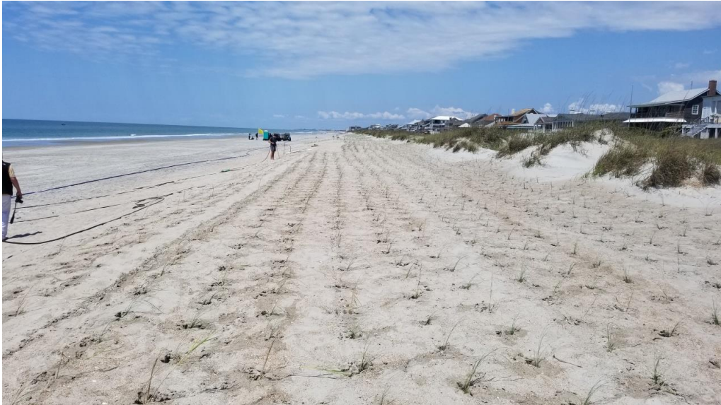
Figure 2 – Good photo of planting from last year (5/14/2020; Atlantic Beach) – notice the top (dune crest) and slope of the newly constructed dune are the zones we plant.

Akin to the Phase I and II projects, a detailed dune planting scope-of-work is included in our dredging contract for Phase III, which incorporates the planting, fertilization, and initial watering of several 100,000s of Sea Oats ( Uniola paniculata ), a bunch of Bitter Panicum ( Panicum amarum ), and some Seashore Elder ( Iva imbricata ) on top and mostly down the entire slope of the newly constructed dune (Fig. 2). The plants (100,000s) are truly native – they were germinated from either seed (Sea Oats and some Bitter Panicum) or cuttings (Bitter Panicum and Seashore Elder) obtained from Emerald Isle back in October 2020 by our subcontractor EarthBalance (Fig 3). Planting started on May 6 th and should be completed in June of this year for the Phase III reach.